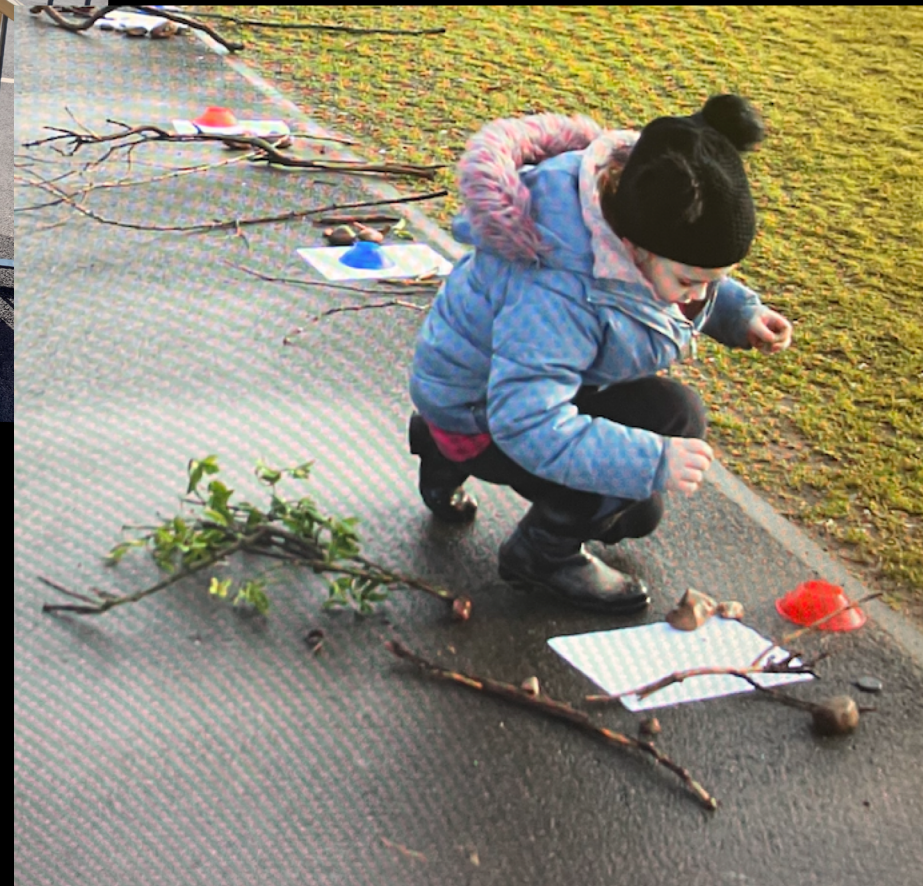
Our EYFS Outdoor Classroom