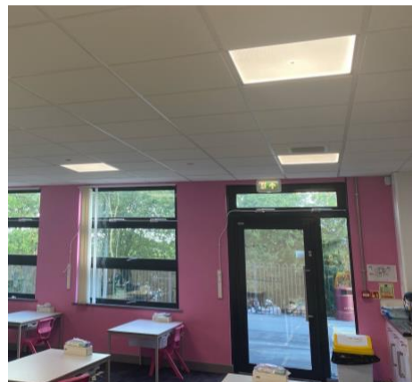
This is the door we will be using to enter and exit our classroom.