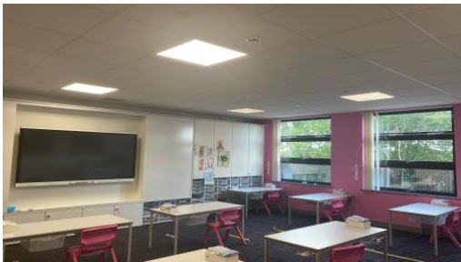
Here is the view of the interactive whiteboard and tables.

Here are some pictures to help you know where we are and what things will look like: