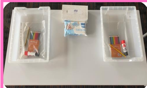
These boxes may be on top of your desks to help ensure that we keep everything clean.